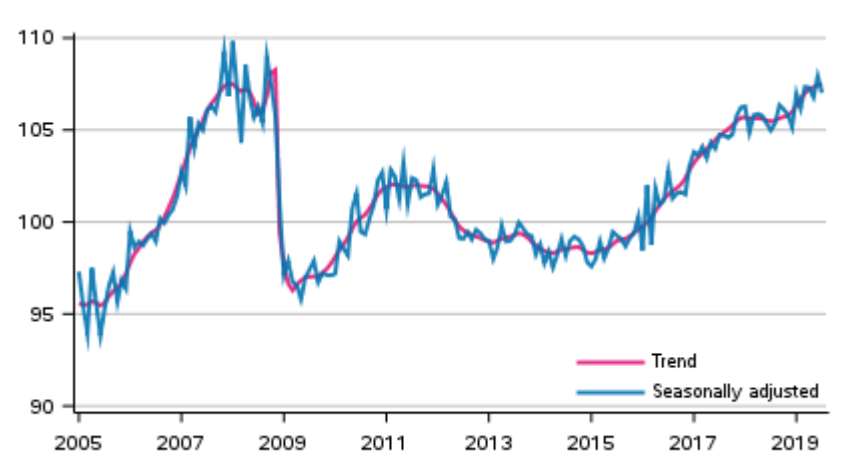
Volume of total output 2005 to 2019, trend and seasonally adjusted series

Adjusted for working days, output went up by 1.7 per cent in July 2019 from one year back. Seasonally adjusted output in turn fell by 0.8 per cent from the month before. According to revised data, working-day adjusted output grew in June by 2.5 per cent (previously 2.2 per cent) from June 2018